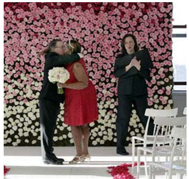
Anything to report? Indiana University's Kinsey Institute has an app that allows users to anonymously report public displays of affection as well as private sexual activity or fantasies on this day of romance.

For more media coverage of Kinsey Institute research, visit our Media page at http://www.kinseyinstitute.org/about/news_media.html